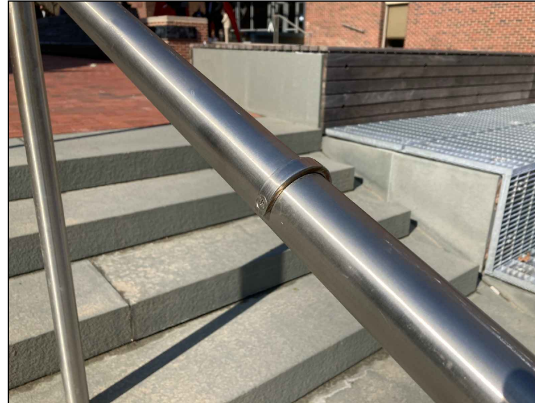
METAL ROD ON RAILING PRECEDENT