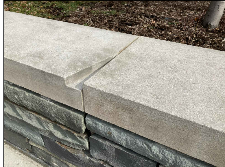
STONE CUT-OUT PRECEDENT