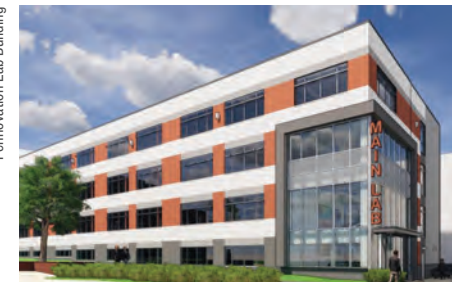
Pennovation Lab Building

In June, Penn announced plans to move forward with the development of a Lab Building on the Pennovation Works site , a four-story, 73,400-square-foot structure with 35,000 square feet of wet lab, office and flex space. It will cater to growing and next stage companies with 10 to 25 employees that need from 2,000 square feet to 10,000 square feet. Work on the building began in summer 2019 and will be completed by August 2020.