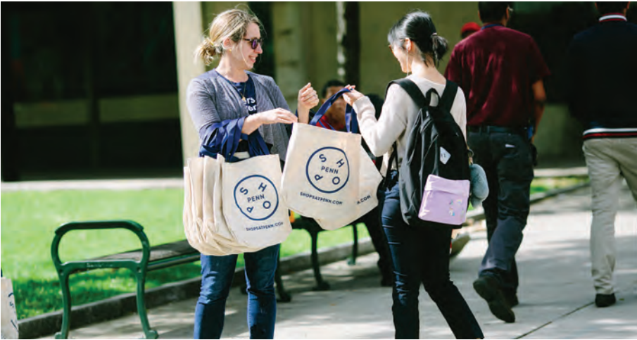
Shop Penn Day

The Real Estate department is responsible for the strategic planning, management, and operation of the non-academic property for the University. The primary centers within the Department are Real Estate Development, Retail, Off-Campus Housing, Office Leasing, Warehouse, and Third Party Leasing. Core disciplines include acquisition and disposition of assets, development partnerships in residential, mixed use and office, operations of real estate holdings and office leasing for academic schools and centers. Working in conjunction with other FRES departments, Real Estate implements urban land development and planning that increases the quality of life for Penn and its surrounding community.