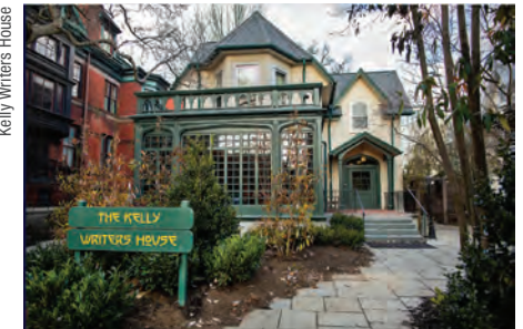
Kelly Writers House

plumbing and fire protection (MEP/FP) systems, and creates new dry lab space for the Center for Cognitive Neuroscience (CCN) for research, office and conference room space.