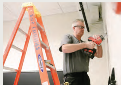
Summer Turn Around