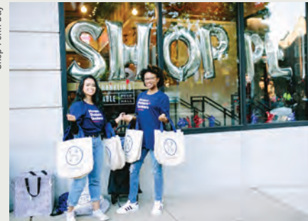
Shop Penn Day

October 2018 featured the first ever Shop Penn Day , a single-day event introducing Penn's newly united retail brand to the University City audience. Our Shop, Dine and Play partners featured giveaways, free tastings, and bargains as part of the celebratory day, and helped further position the compact, dynamic retail district as a premier destination for food, fashion, art, culture, and more.