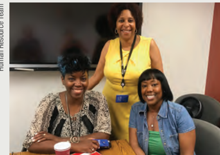
Human Resource Team

During FY19, FRES IT worked with the Human Capital Management (HCM) team and the time clock application Kronos to develop interface programs that would send data to Workday and receive data back from it. These integrations went into production on July 1 during the transition to Workday.