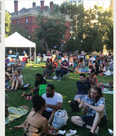
40th Street Summer Series

The 40th Street Summer Series—co-produced by University City District, Penn, and The Rotunda—continues to be one of the most popular events in University City. This free outdoor concert series features talented performers throughout the summer, including a performance by the Sun Ra Arkestra at Pennovation Works. In 2019, the series moved to a new location at 39th and Walnut streets, adjacent to Locust Walk.