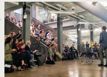
Philly Tech Week

In May, the Pennovation Center hosted four events for Philly Tech Week 2019 . These events were excellent opportunities to introduce a large section of the Philly tech community to the resources and talent at Pennovation Works.