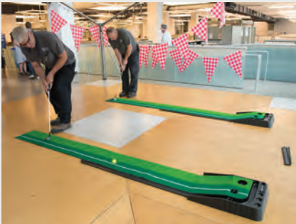
FRES Summer Picnic

This past July, FRES Staff once again gathered for an afternoon of food and socializing at the annual FRES Summer Picnic . Due to a forecast of thunderstorms, the picnic was relocated to the lobby of the Left Bank, where the afternoon's festivities included a delicious lunch buffet, games and music, and fun with colleagues and friends.