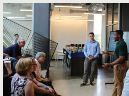
The Pennovation Accelerator

The Pennovation Accelerator invites a cohort of local startups to engage in a six-week program to develop their business strategy and cultivate their network. Cohort companies are hosted at the Pennovation Center and participate in weekly educational sessions presented by subject matter experts.