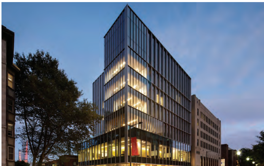
Perelman Center for Political Science and Economics

The Office of the University Architect is responsible for the oversight of the design, physical development, and preservation of University facilities, including off-campus facilities (Morris Arboretum and the New Bolton Center for Veterinary Medicine). The University Architect oversees the University's design review process, campus planning, and designer selection, as well as zoning and accessibility requirements. The staff in the Department also facilitates the Capital Plan, oversees landscape design and improvements, signage, and sustainability efforts for the University. The Department is responsible for tracking and maintaining all space data, such as floor plans, square feet, and departmental areas for the University.