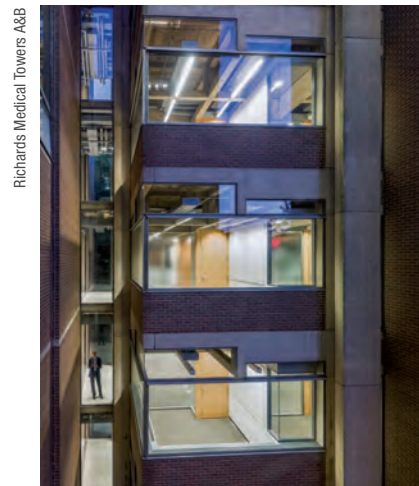
Richards Medical Towers A&B

Kelly Writers House , a gathering place and incubator for writers at Penn and the greater Philadelphia community, underwent a $2.2M renovation in FY19. Built in 1851, the Writer's House is one of the oldest buildings on Penn's campus. The front parlor known as the Arts Cafe, which stages community readings and public events, was revitalized and expanded to be more usable and technologically friendly.