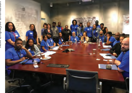
New Employee Orientation