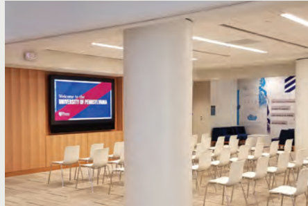
Cohen Admissions Visitor Center

The Cohen Admissions Visitor Center was relocated from College Hall to Claudia Cohen Hall in 2019, in order to increase its square footage and feature enhanced amenities including an auditorium to host potential students and their families. The $4.3M relocation and renovation was substantially complete in May 2019.