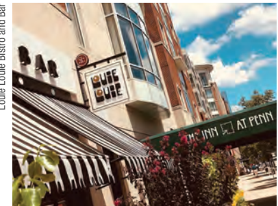
Louie Louie Bistro and Bar

University City gained another exciting dining destination with the opening of Louie Louie Bistro and Bar in August 2018. Located on the ground floor of the Hilton Inn at Penn, Louie Louie is an American bistro with French flair, influenced by the cafes of Europe. The restaurant features an exciting menu and craft beer and cocktail list, and a whimsical, vintage-inspired décor.