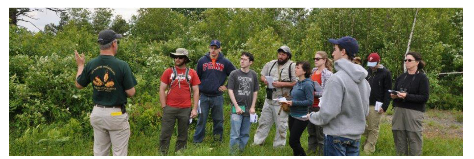
Master of Environmental Studies Field Class